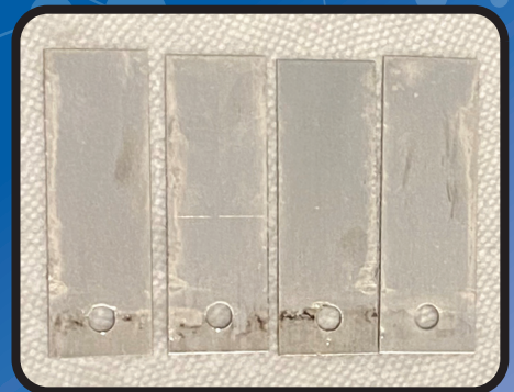
COLDIP ® ALPASS 455 CS

7075-T6 Aluminum alloy panels coated with COLDIP ® ALPASS 455 CS exhibited little to no corrosion after 450 hours of salt spray testing.