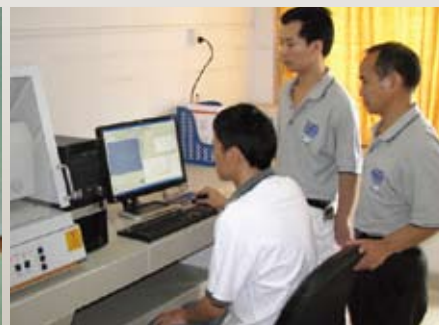
美德耐化工的新X射线分析仪 Metalite Chemical's new Fischerscope X-Ray Unit.